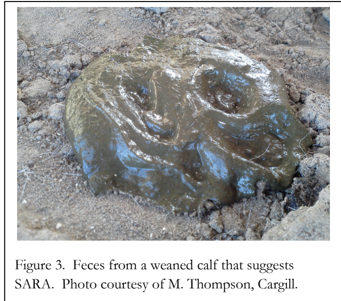
Figure 3. Feces from a weaned calf that suggests SARA.