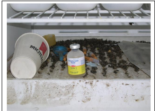
Figure 1. Example of a poorly managed refrigerator/freezer.

On another farm I visited recently, it appeared that the producer had implemented a program to monitor the internal refrigerator temperature. Inside the fridge was a thermometer that was placed in the back of the fridge. At the time I visited the farm, the fridge was unplugged and the temperature inside the fridge was about 70 F. I asked the calf worker why it wasn't plugged in. He replied that it was "making funny noises" so they unplugged it. When? I asked. "About a week ago, maybe more" was the response. "Did you tell the manager?" "No" was the reply. "They've had too many other things to do and just forgot." "Did you move the contents?" "No" again was the reply. "Too busy. Besides, we don't use the stuff in the fridge very often." I then asked about the four bottles of colostrum in there. "How long have they been in the fridge?" I asked. "Oh, just a few days. We try to use colostrum right away." I opened the fridge and picked up one of the bottles. It smelled nasty and had chunks of coagulated protein (along with a bunch of flies) floating in the top of the two quart bottle. "Looks like this one's gone bad" I said. "You won't be using this one, will you?" The worker replied, somewhat sheepishly "No, of course not." He grabbed the bottle from my hand and dumped it into the sink. Clumps and chunks of clotted protein dropped